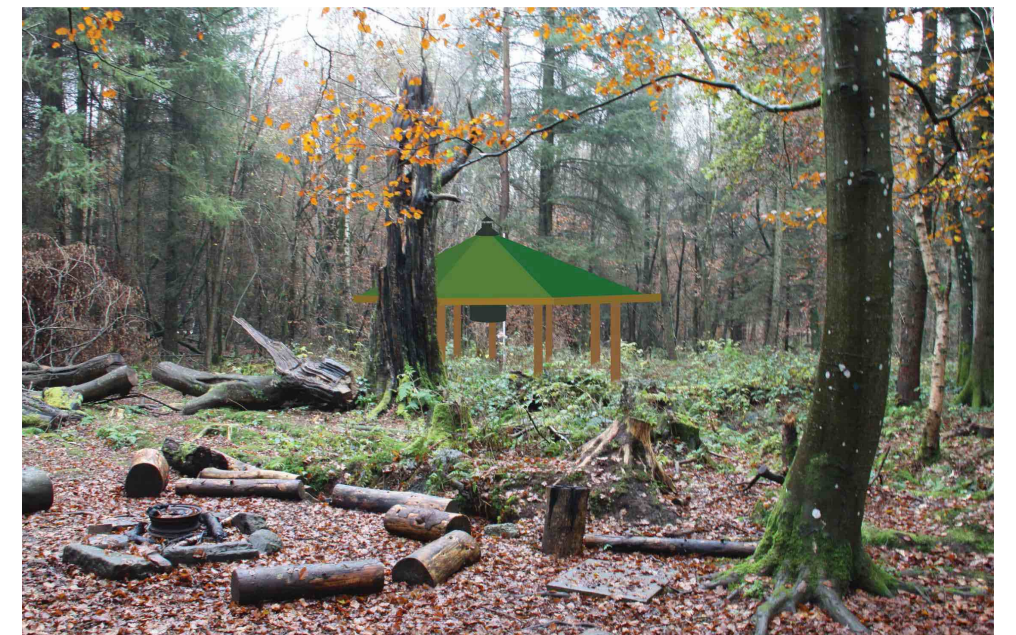
VIEW FROM SOUTHWEST